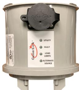
Safely connect a portable generator to your home in minutes with a GenerLink Transfer Switch.