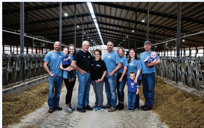
Kohls Dairy is a consumer member of Oconto Electric Cooperative.

Local residents and visitors to the area will have the opportunity to view much of the dairy's operation on