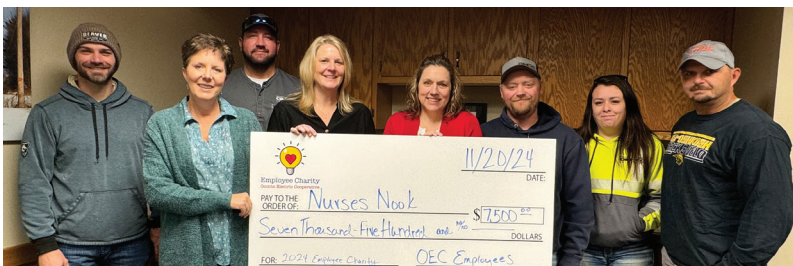
The Nurse's Nook program provides students in Oconto County with basic needs and other resources to improve their overall health, wellness, and school attendance. We awarded them $7,500 to help support their program.