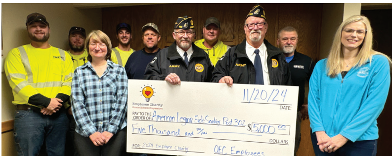
The Oconto Falls American Legion Eick-Sankey Post 302 was awarded $5,000 to upgrade uniforms for their Honor Guards to be worn when providing military funeral services.